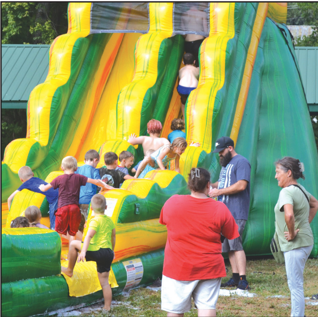
More photos on page 2.