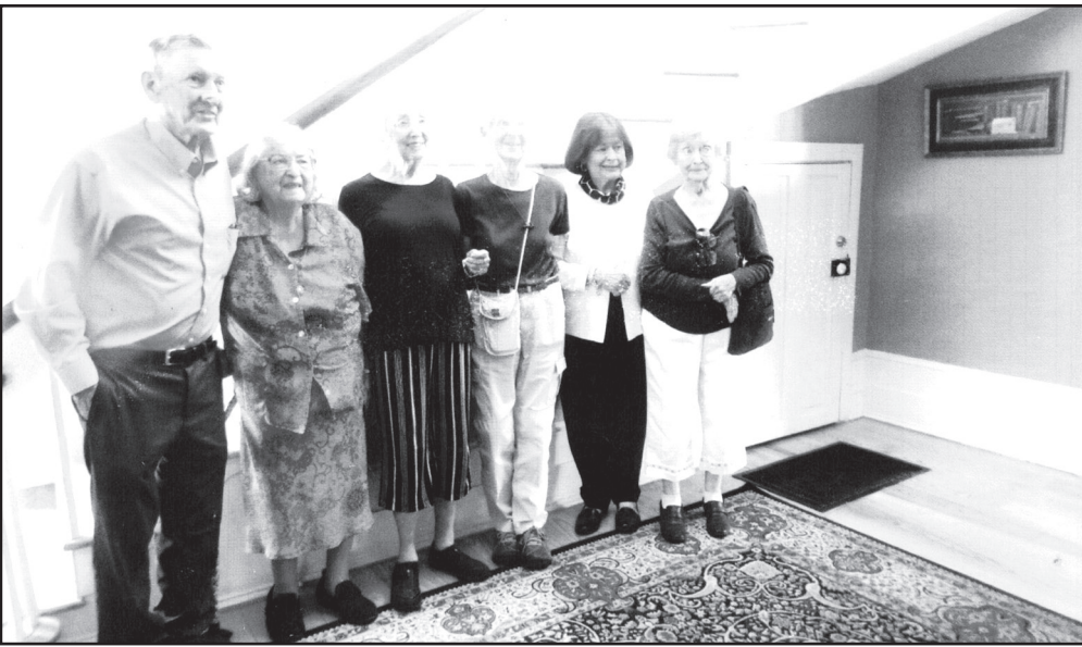
CLASS OF 1955