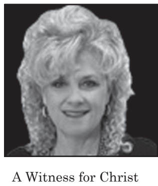
A Witness for Christ

overthink it. I mean it's like I had a old military buddy who worked security for Madonna back in the day when she first exploded on the pop culture scene! My buddy said some MTV executives decided to host a Madonna look-a-like-contest. Her style and look was very unique and young women across the globe were hooked on the Madonna look and fashion. To add merriment to the festive occasion, Madonna entered the contest under a false name. She came in third.