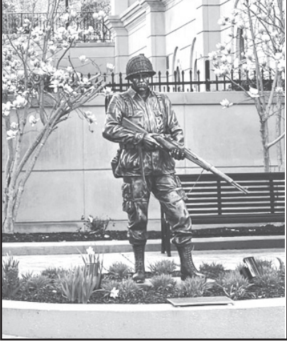
Fleming County's Franklin Souleley Memorial is just one of our Garden Club's community beautification projects.