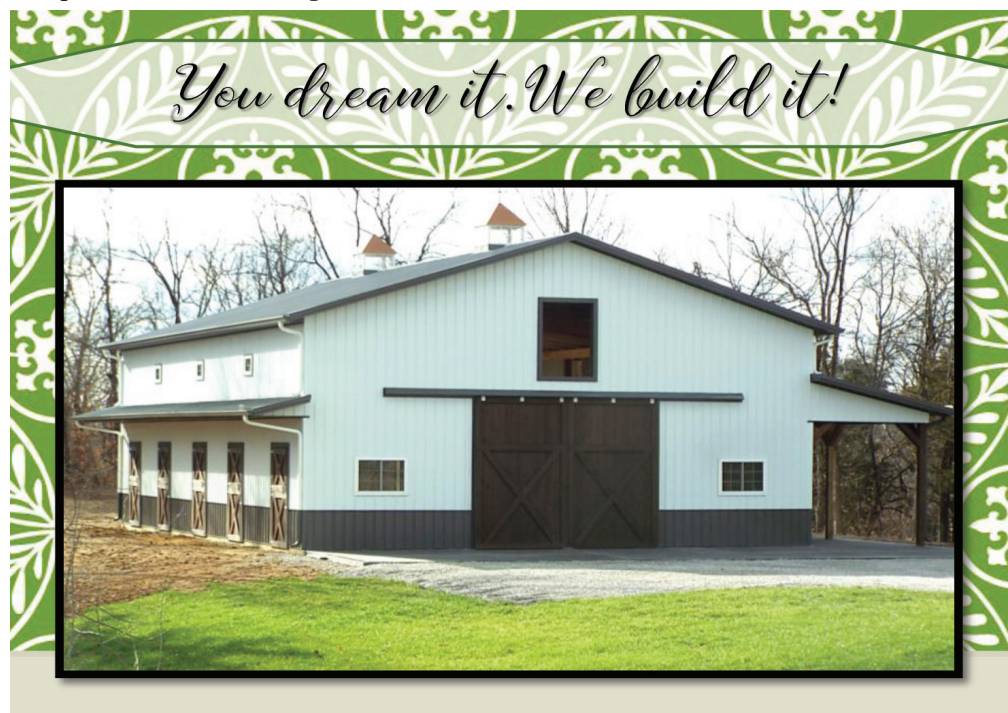
SHEDS, HORSE BARNS, RIDING ARENAS, GARAGES, SHOPS