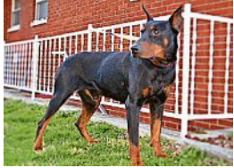
DOBERMAN PINSCHER PUPS AKC CALLS ONLY 606-878-6395

*PUPPIES* Twin Oaks Kennels LLC Specializing in small breed family puppies. F1b Yorkiepoo 2 litters, F1b Cockerpoo 2 litters, Shihtzu-poo, Shihtzu-Maltese, 1 yr health contract, UTD shots & more. Located in Western KY area. Reduced Breeds Available. FACEBOOK: Twin Oaks Kennels, LLC. www.twinoakskennels.com 270-601-3210 or 815-520-3607