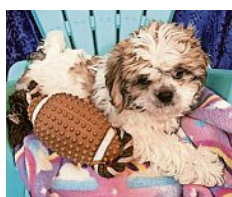
Ocherese.com Ocherese pups from breed originator. New Lovable Companions pups ready for your arms! M $850; F $950. Peewee M $1200. Time to meet YOUR sweet bundle o' love! Call 812-582-0682 or 893-0281. No answer? Leave message.