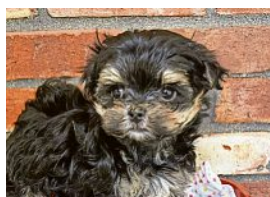
OCHERESE Pups for sale, mix of Poodle, Pekinese, Maltese, small, smart, NON-SHEDDING, M&F, vaccines UTD, paper/crate trained, raised in loving home, Loc near Lou, KY, call/text for info. (502) 314-0195