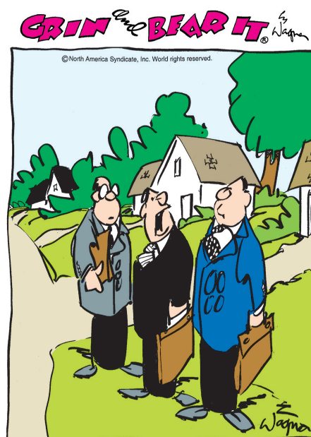
"When we formed this carpool, I assumed one of us had a car!"