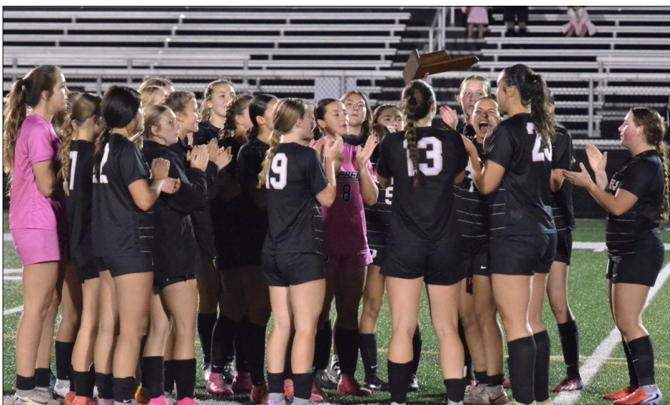
Boyle County players celebrate Wednesday after receiving the trophy for their fifth consecutive 45th District championship.