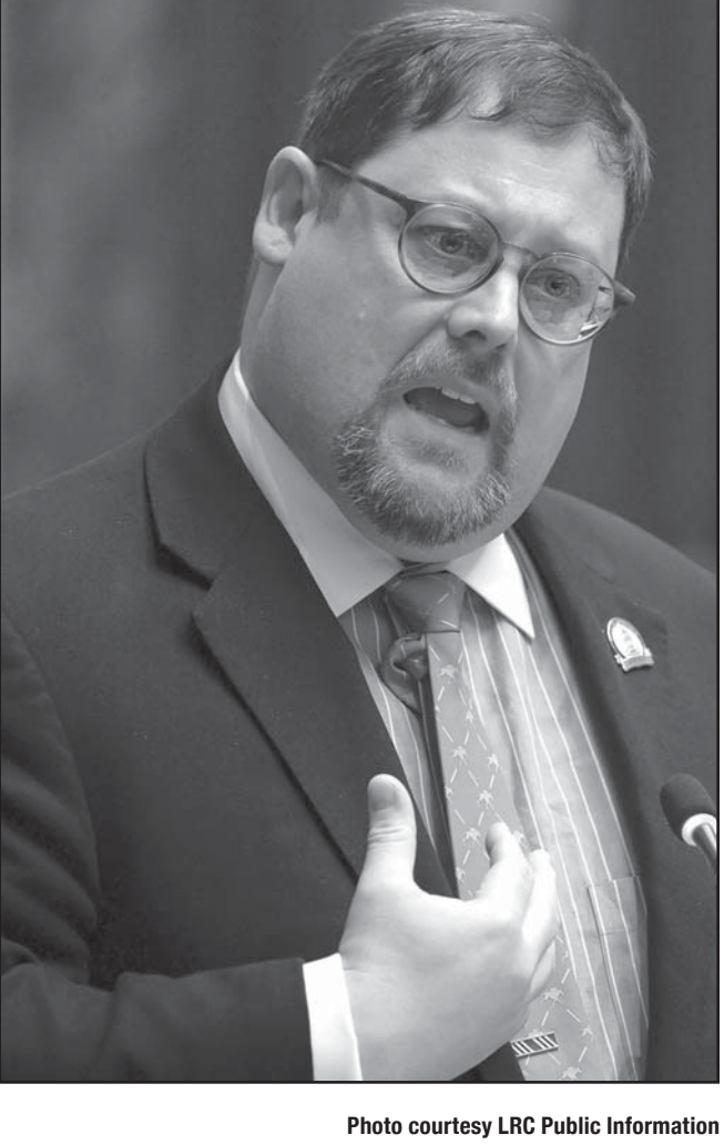
Sen. Phillip Wheeler, R-Pikeville, speaks on Senate Bill 6, an act related to postsecondary institutions, on the Senate floor on Feb. 13.